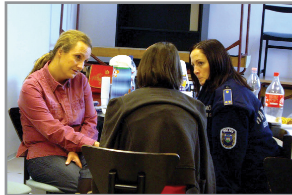
Veszprém, March 2010