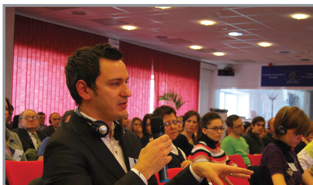
Comment from the audience