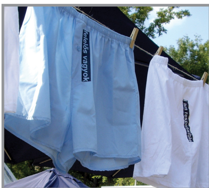
Main prize, with "I am responsible" written on the fly