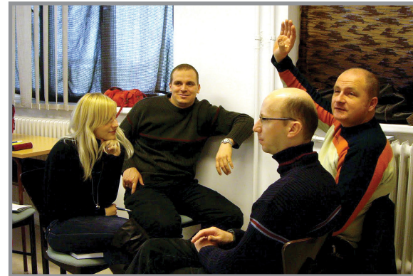
Veszprém, March 2010