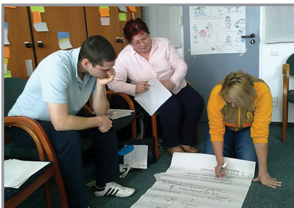
Budapest, March 2010