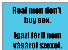
Refrigerator magnet: prize for those who filled out the quiz correctly