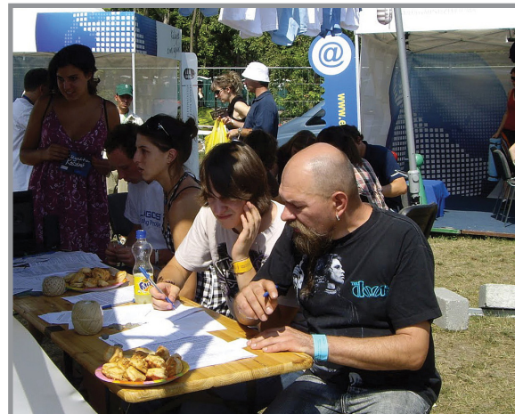
Quiz and scones