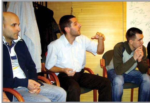
Budapest, February 2010