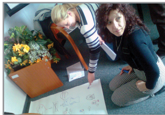
Budapest, March 2010