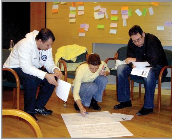
Budapest, February 2010